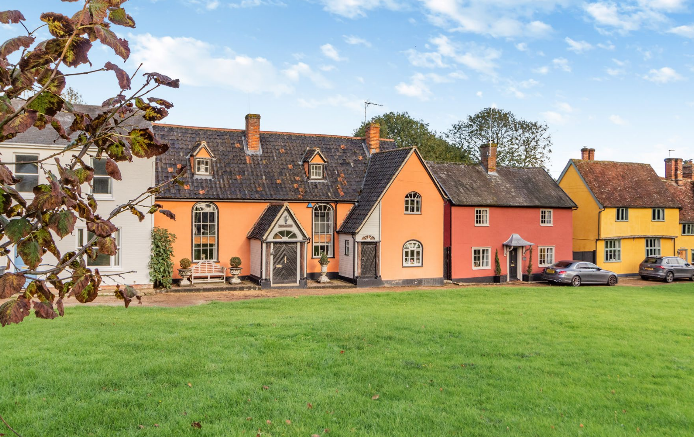
THE OLD CHAPEL Hartest, Suffolk