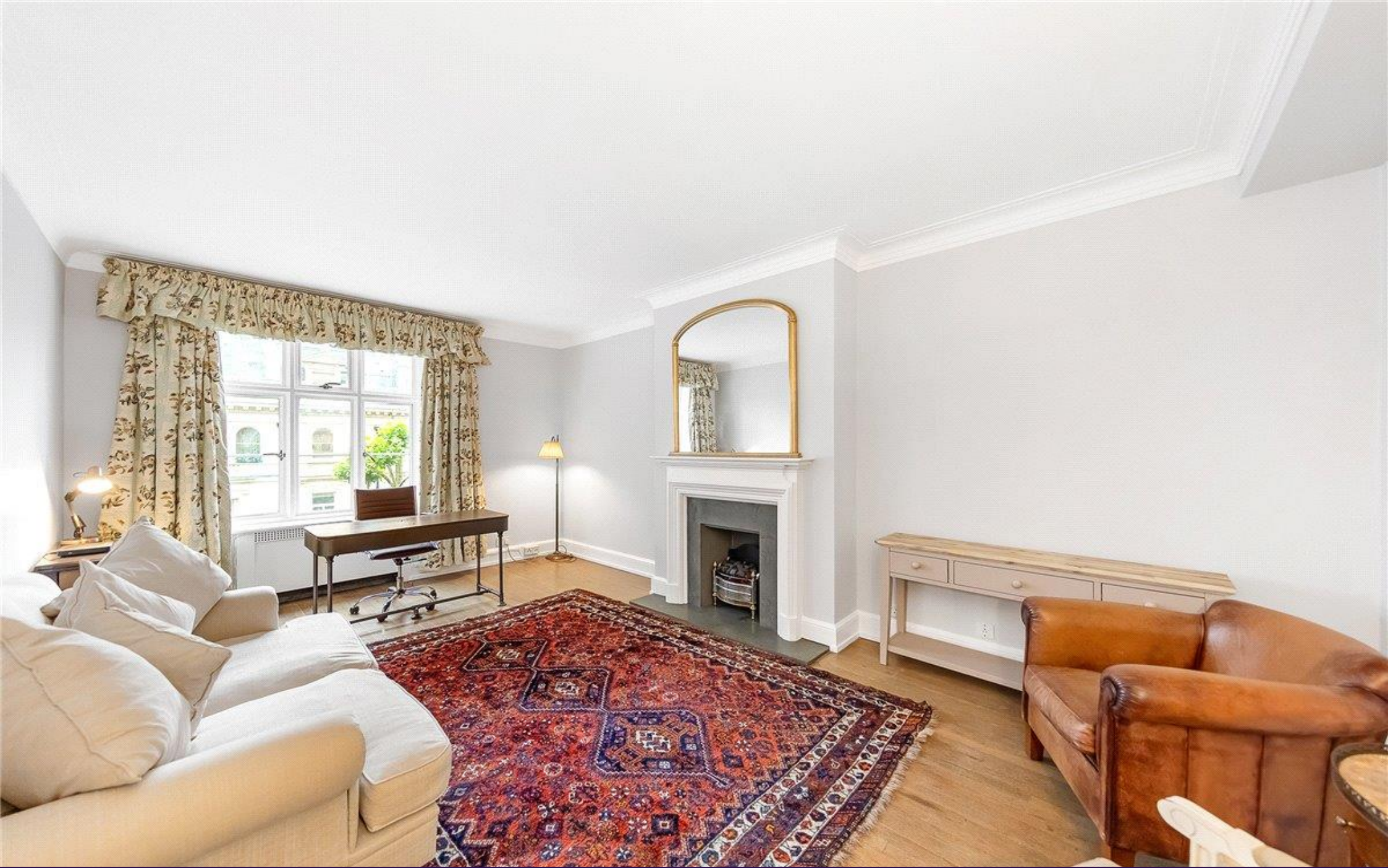
CHESTERFIELD HOUSE, CHESTERFIELD GARDENS, W1J £1,250,000