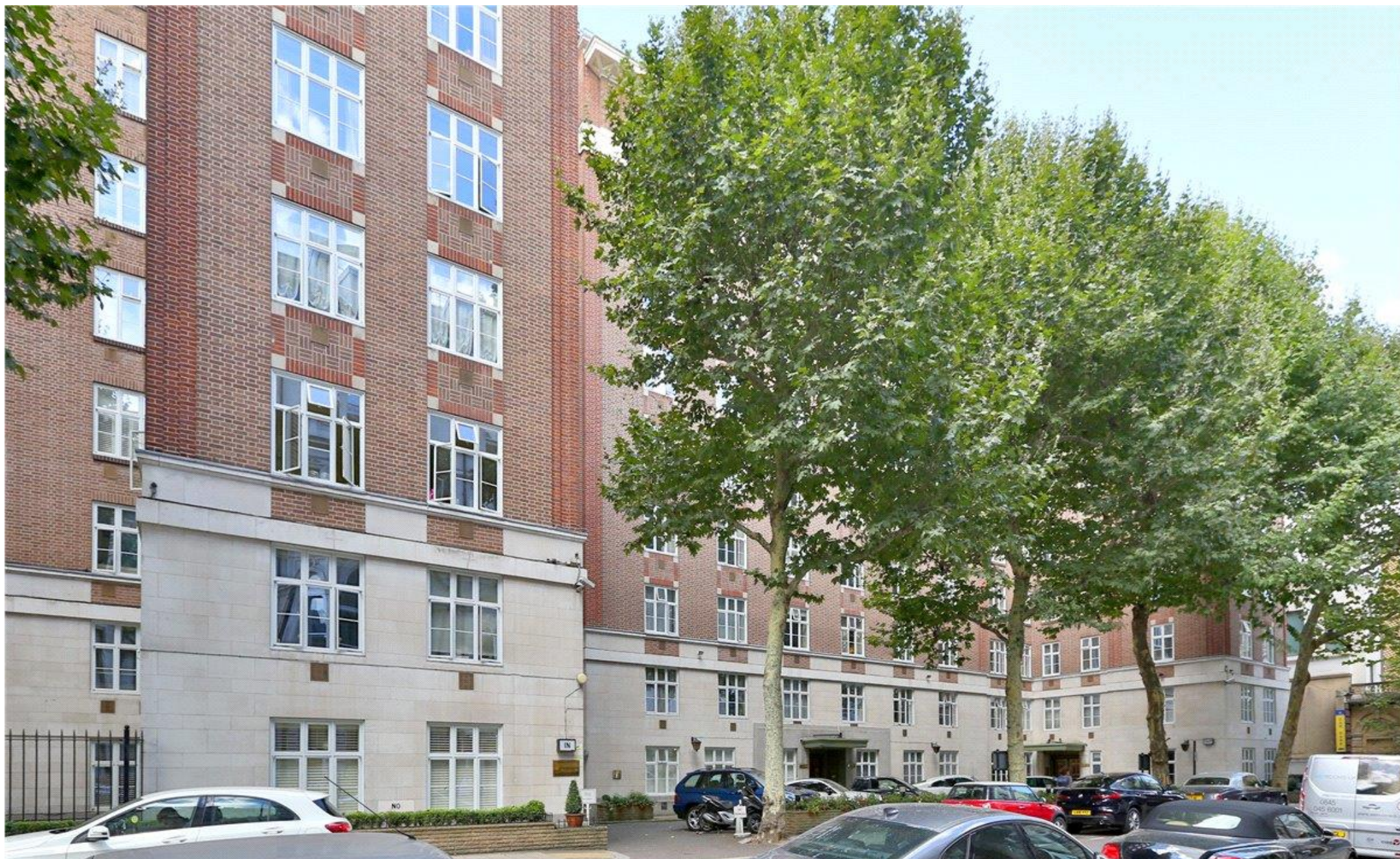
CHESTERFIELD GARDENS, MAYFAIR, W1J £1,350,000