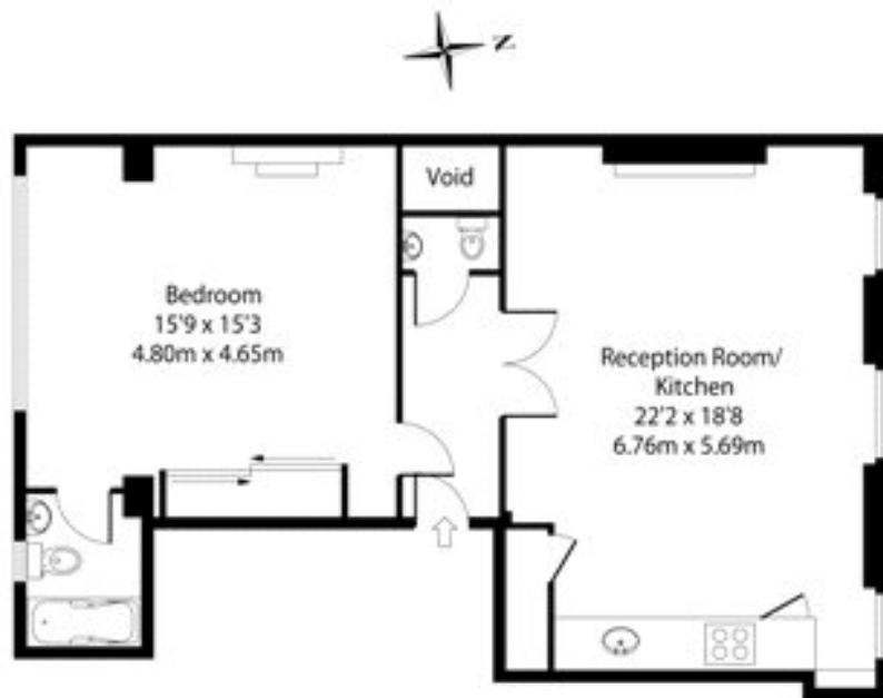
First Floor GLOUCESTER PLACE

APPROX. GROSS INTERNAL FLOOR AREA 675 SQ FT / 62.71SQ M