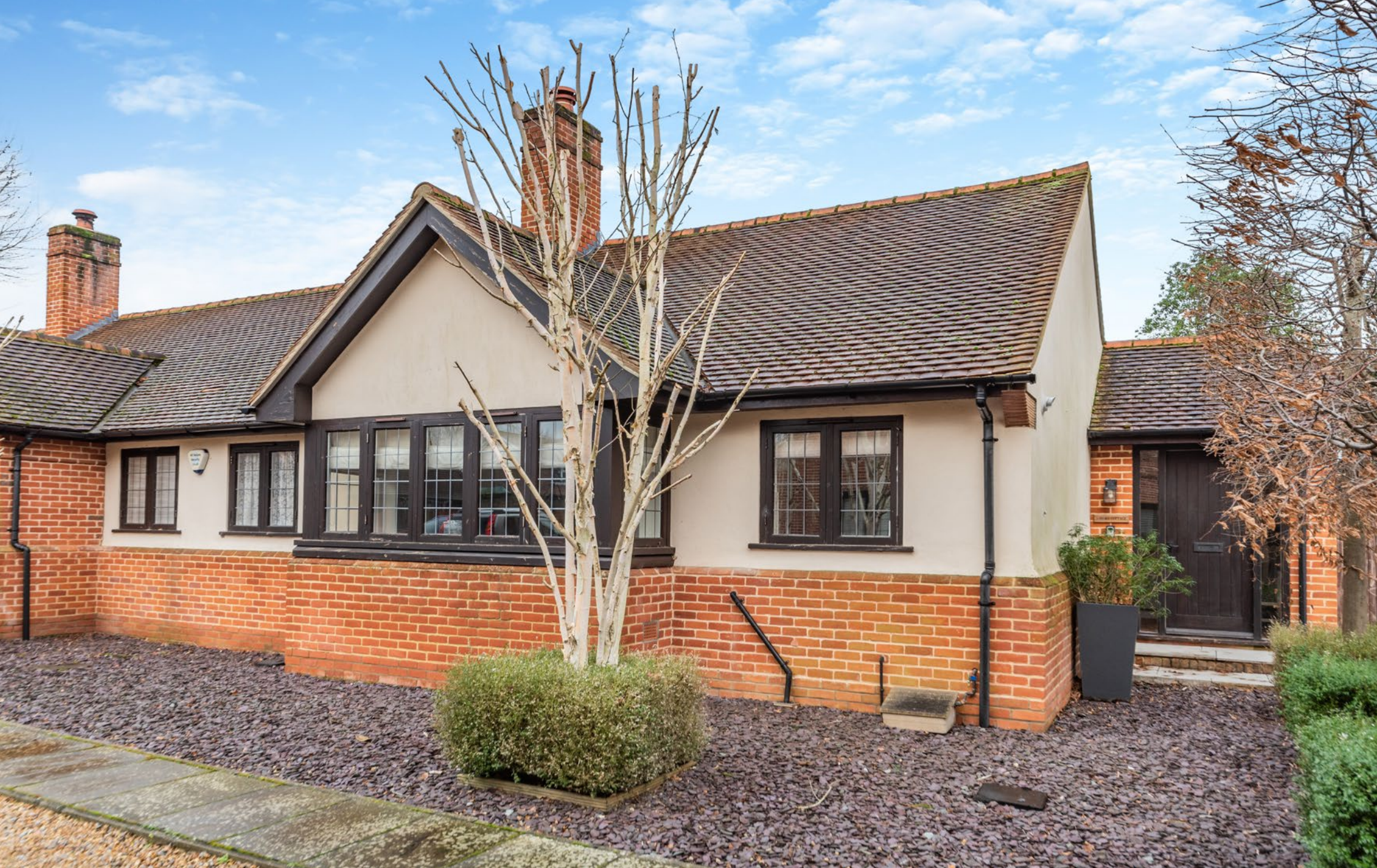
3 MEWS COTTAGE Guide Price £535,000