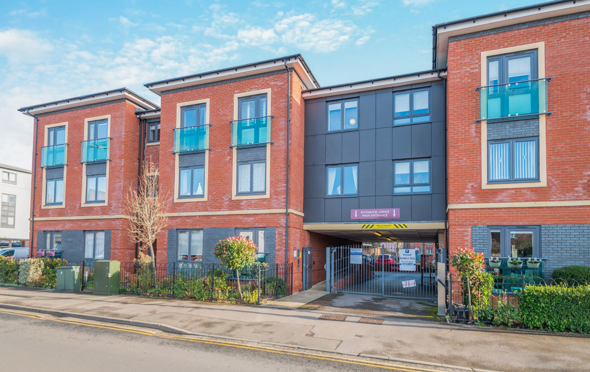
41 AVONBANK LODGE Guide Price £420,000