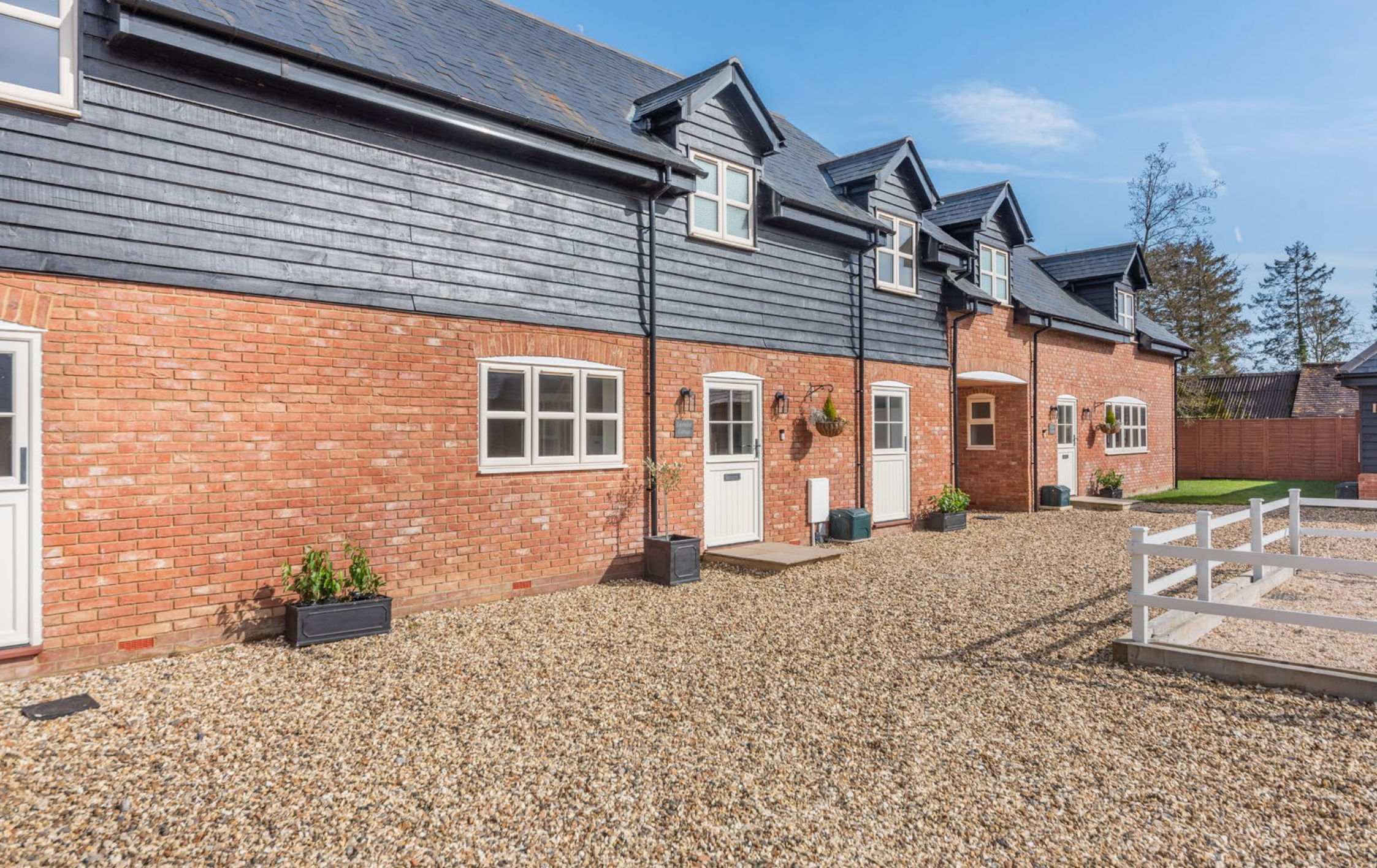
LAVENDER COTTAGE Guide Price £625,000