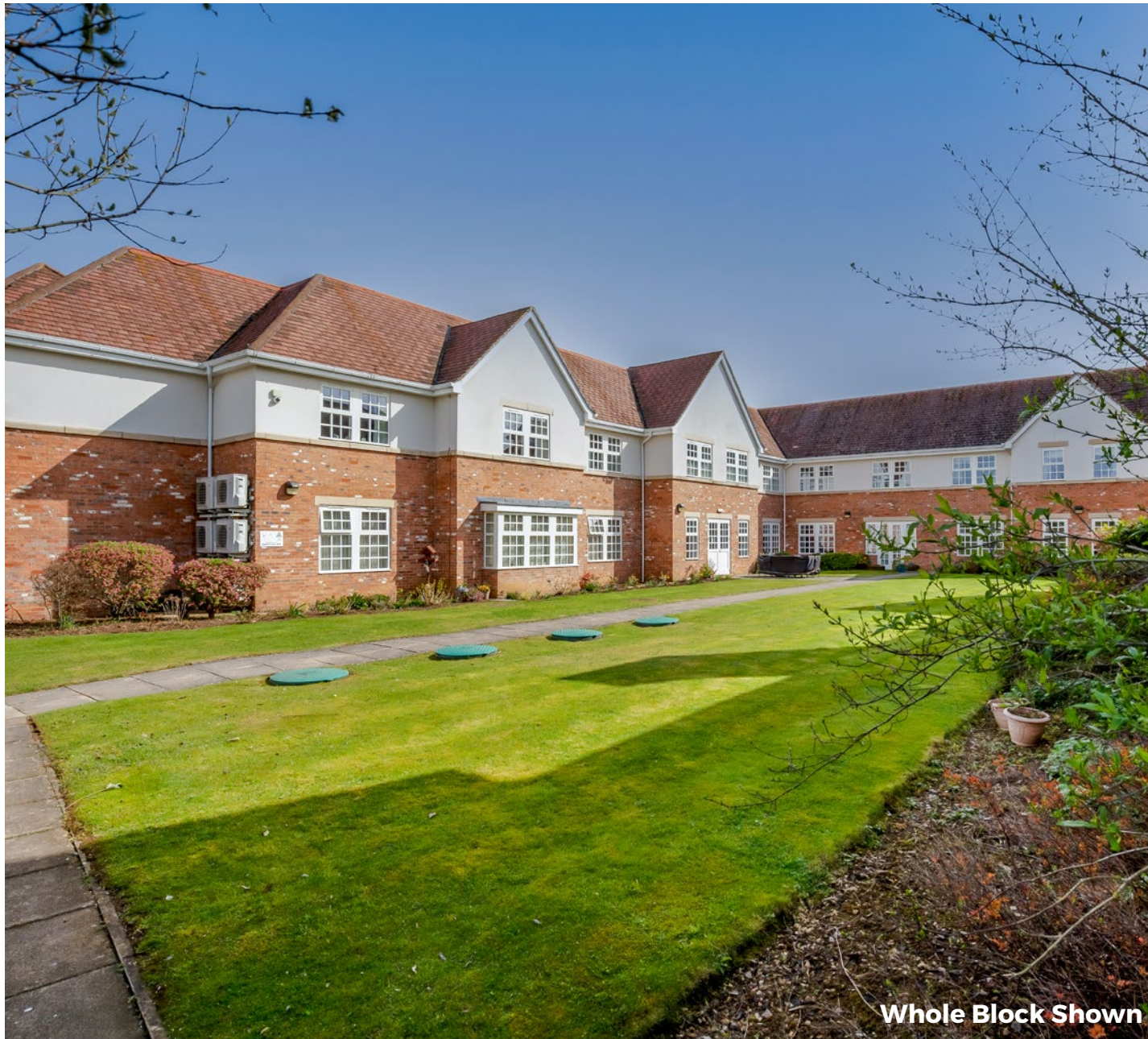
Whole Block Shown