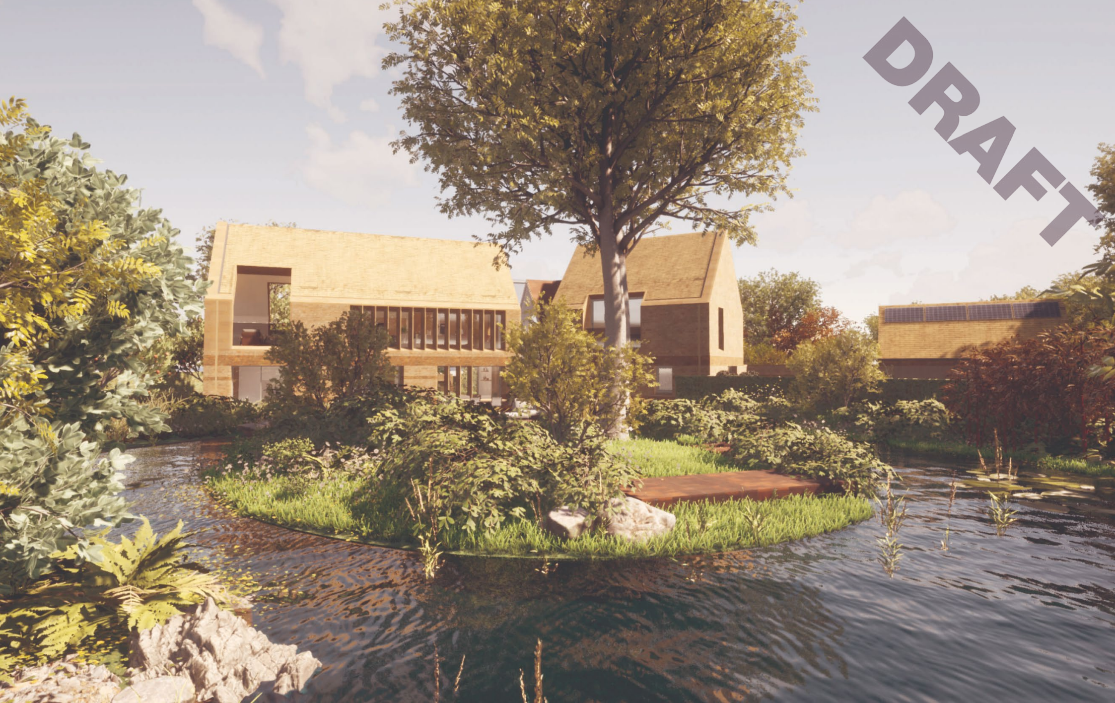
FEVER TREE HOUSE Holcot, Northamptonshire