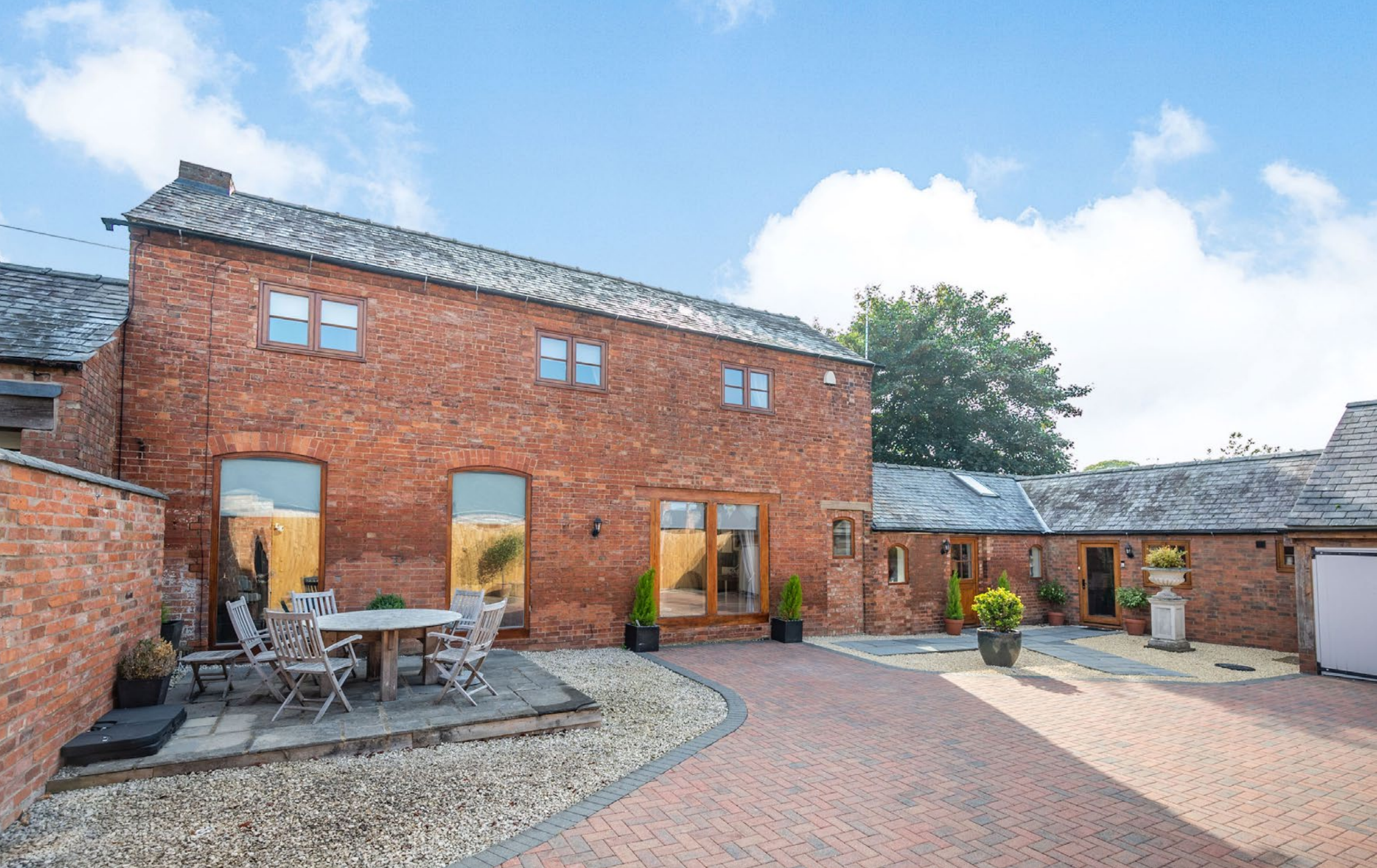
THE BARNS North Kilworth, Leicestershire