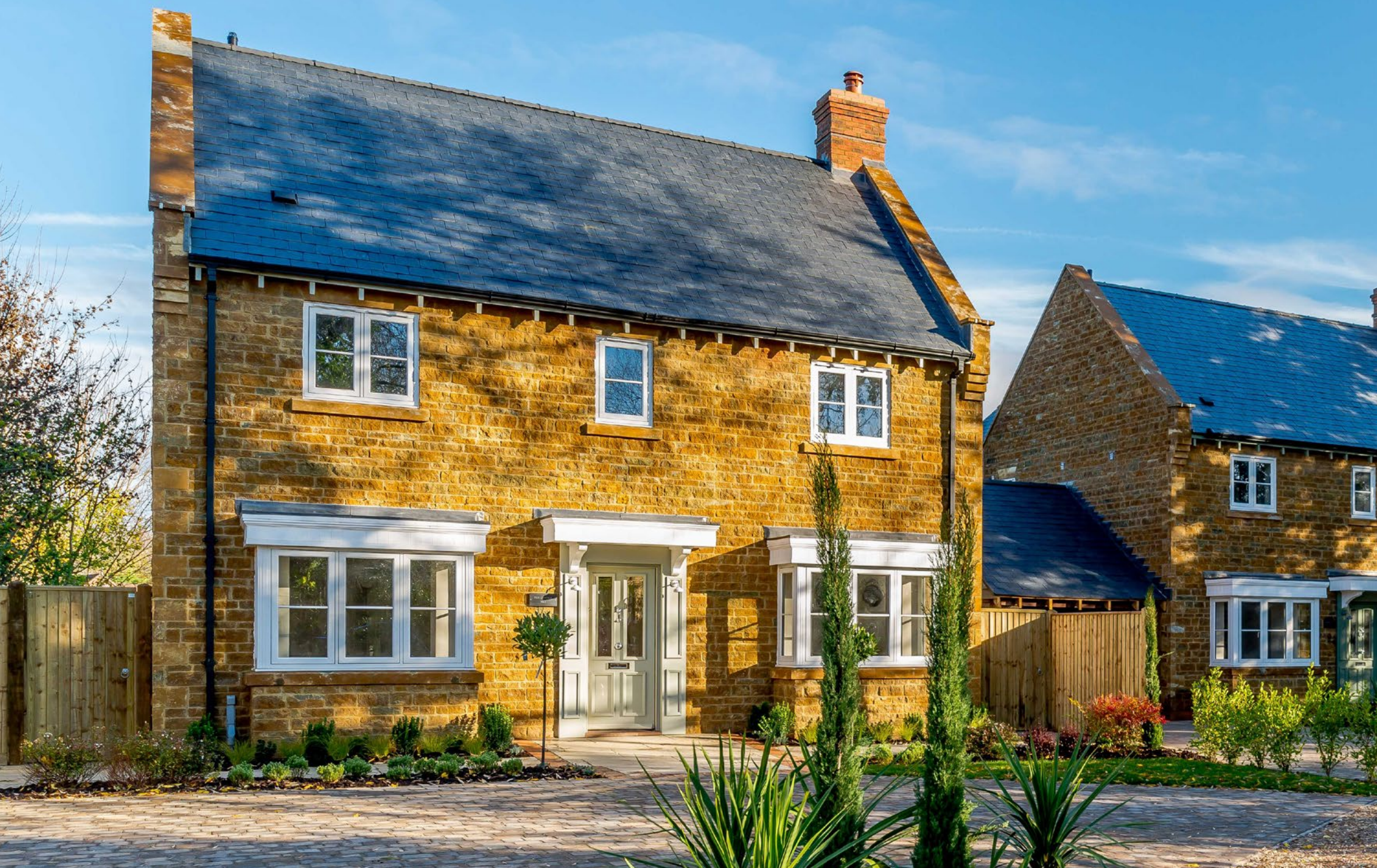
FOX GRANGE Priors Marston, Warwickshire