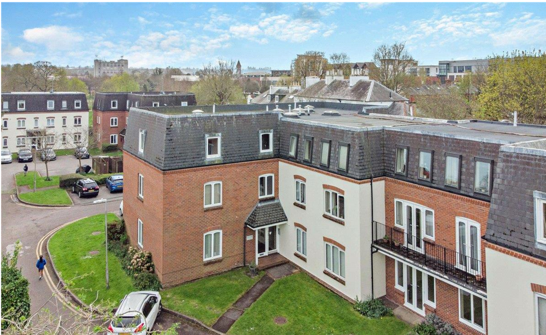
BEECH COURT, VICTORIA GARDENS, NEWBURY, RG14 1EY £1,100 per month*