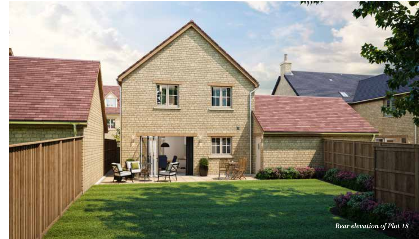
Rear elevation of Plot 18

Internal Living Area: 146m 2 | 1,571sq ft 2 Garage Area: 18m 2 | 194sq ft 2 Total Area: 164m 2 | 1,765sq ft 2