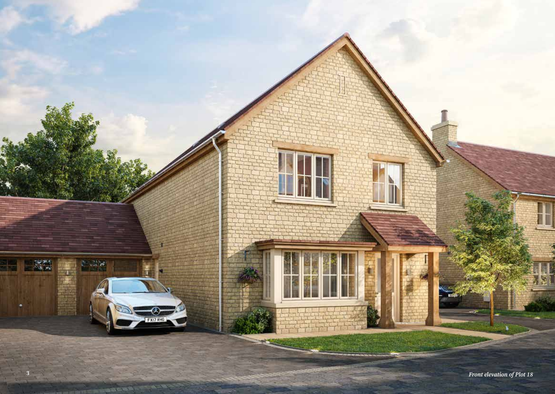
Front elevation of Plot 18