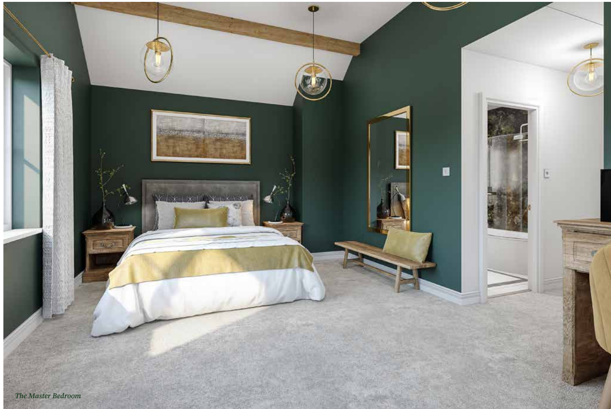
The Master Bedroom