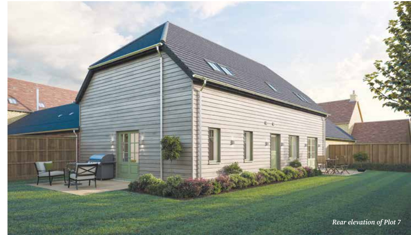
Rear elevation of Plot 7

Internal Living Area: 150m 2 | 1,615sq ft 2 Garage Area: 18m 2 | 194sq ft 2 Total Area: 168m 2 | 1,809sq ft 2