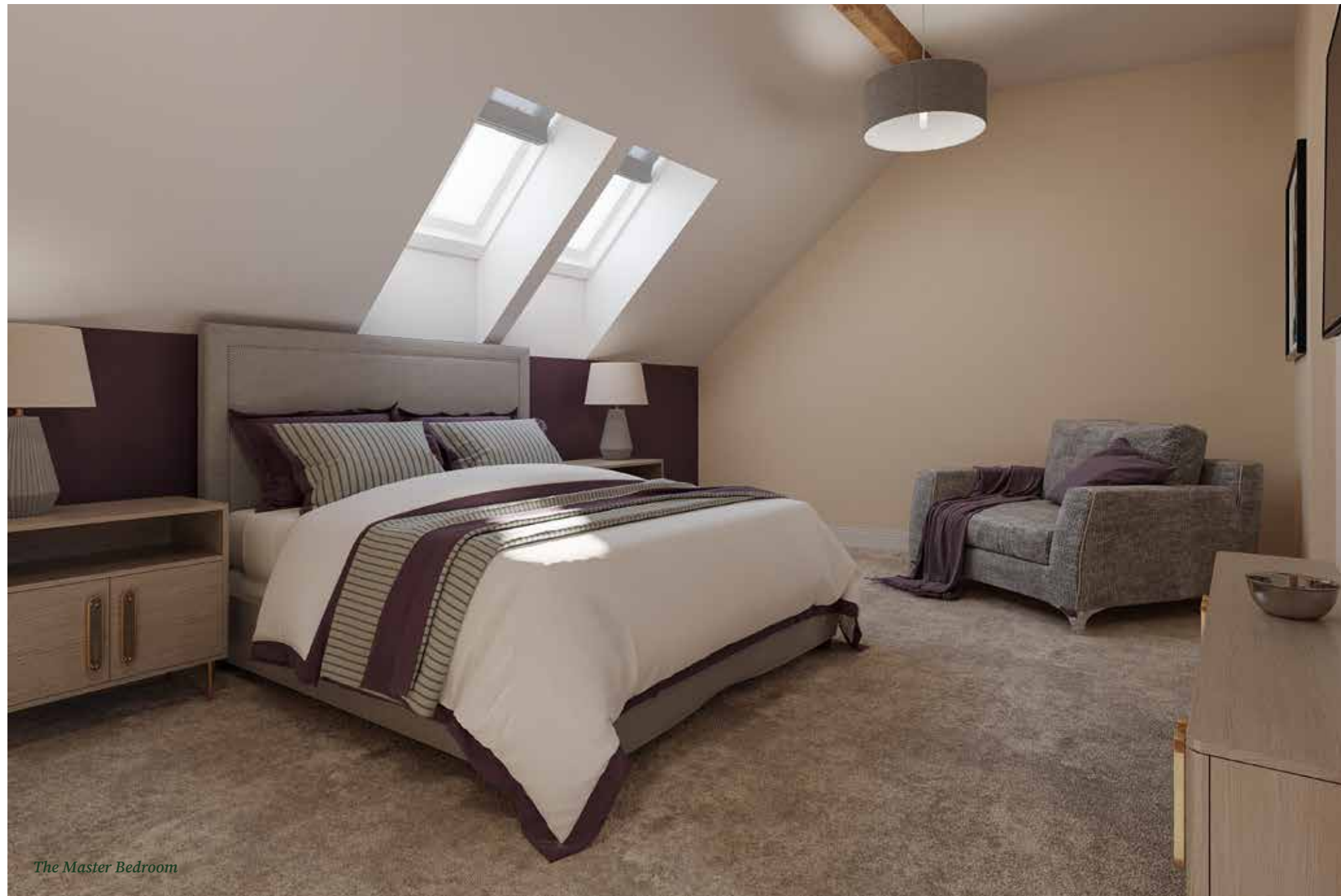
The Master Bedroom