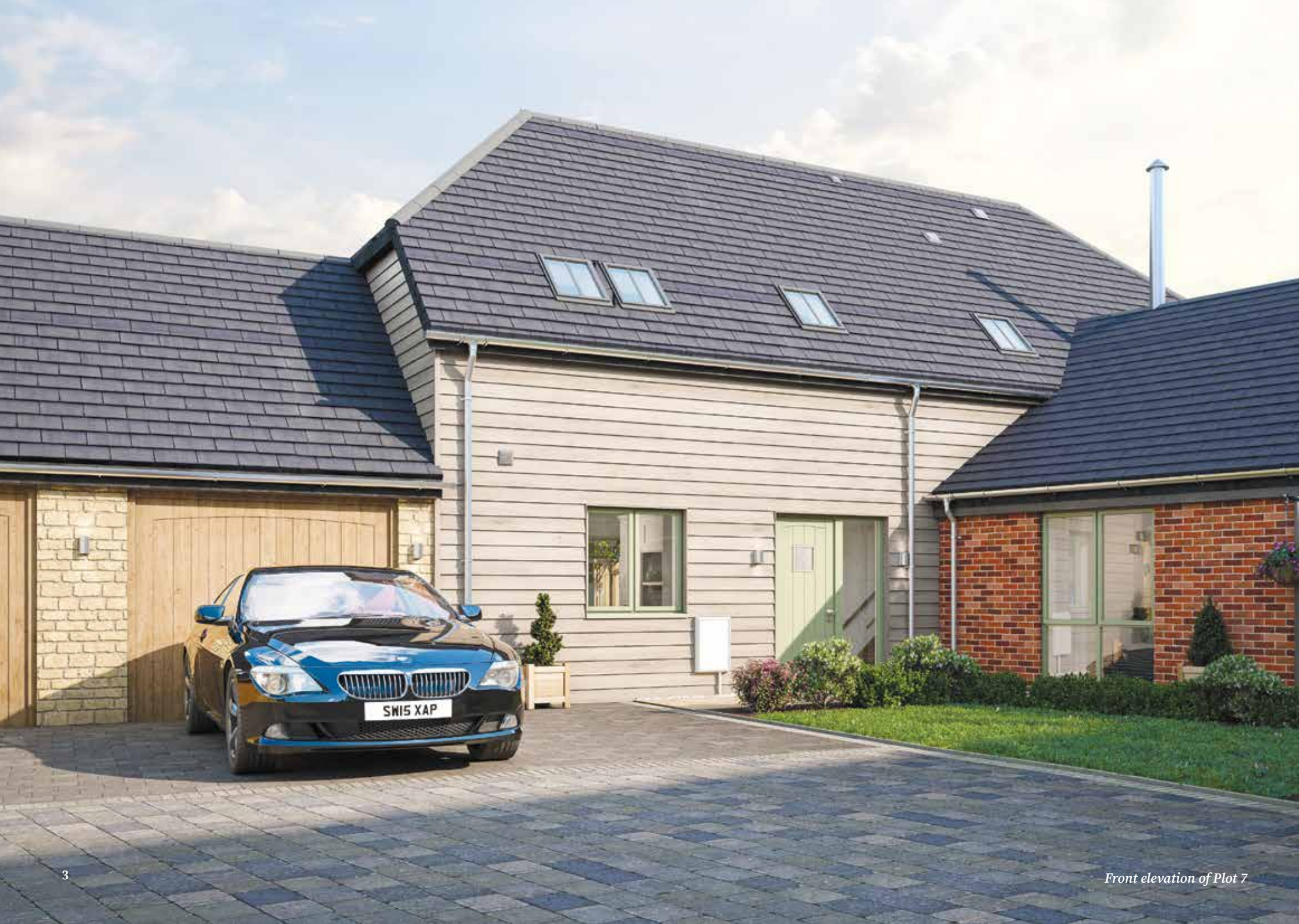
Front elevation of Plot 7