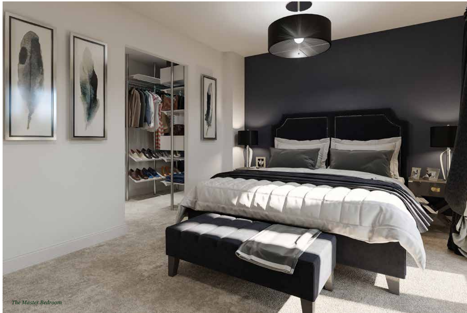
The Master Bedroom