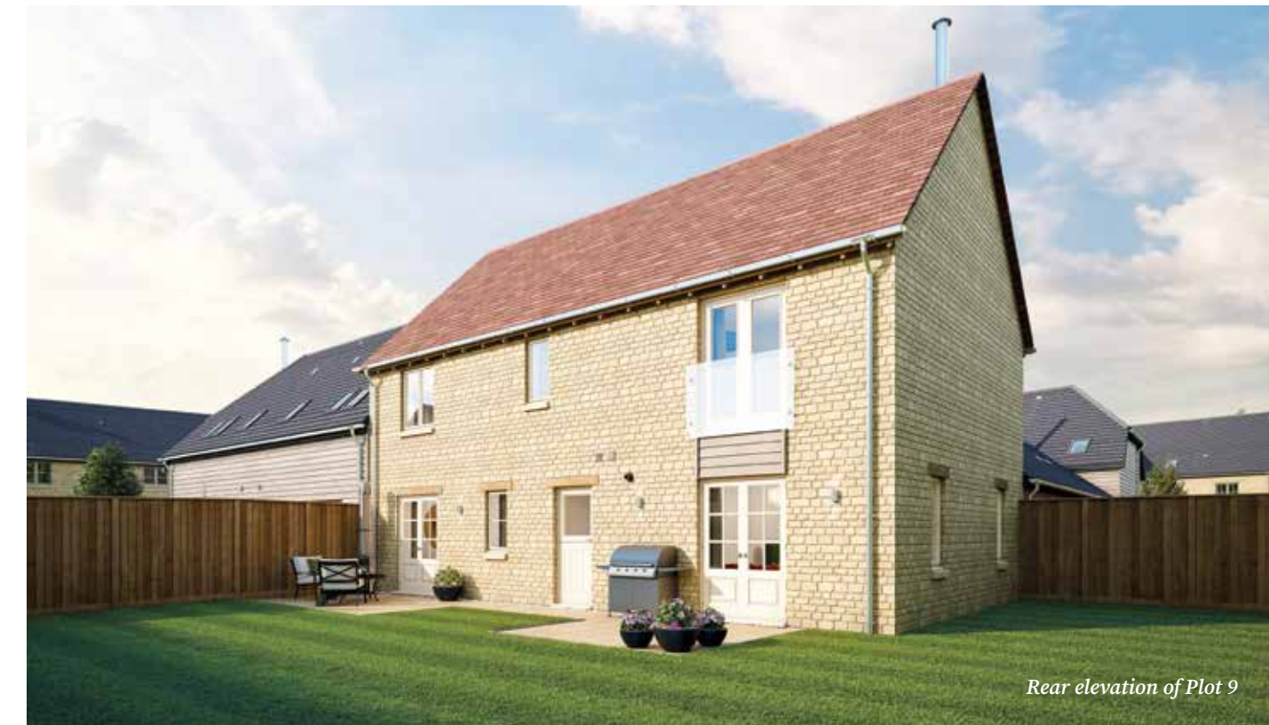
Rear elevation of Plot 9

Internal Living Area: 144m 2 | 1,550sq ft 2 Garage Area: 18m 2 | 194sq ft 2 Total Area: 162m 2 | 1,744sq ft 2