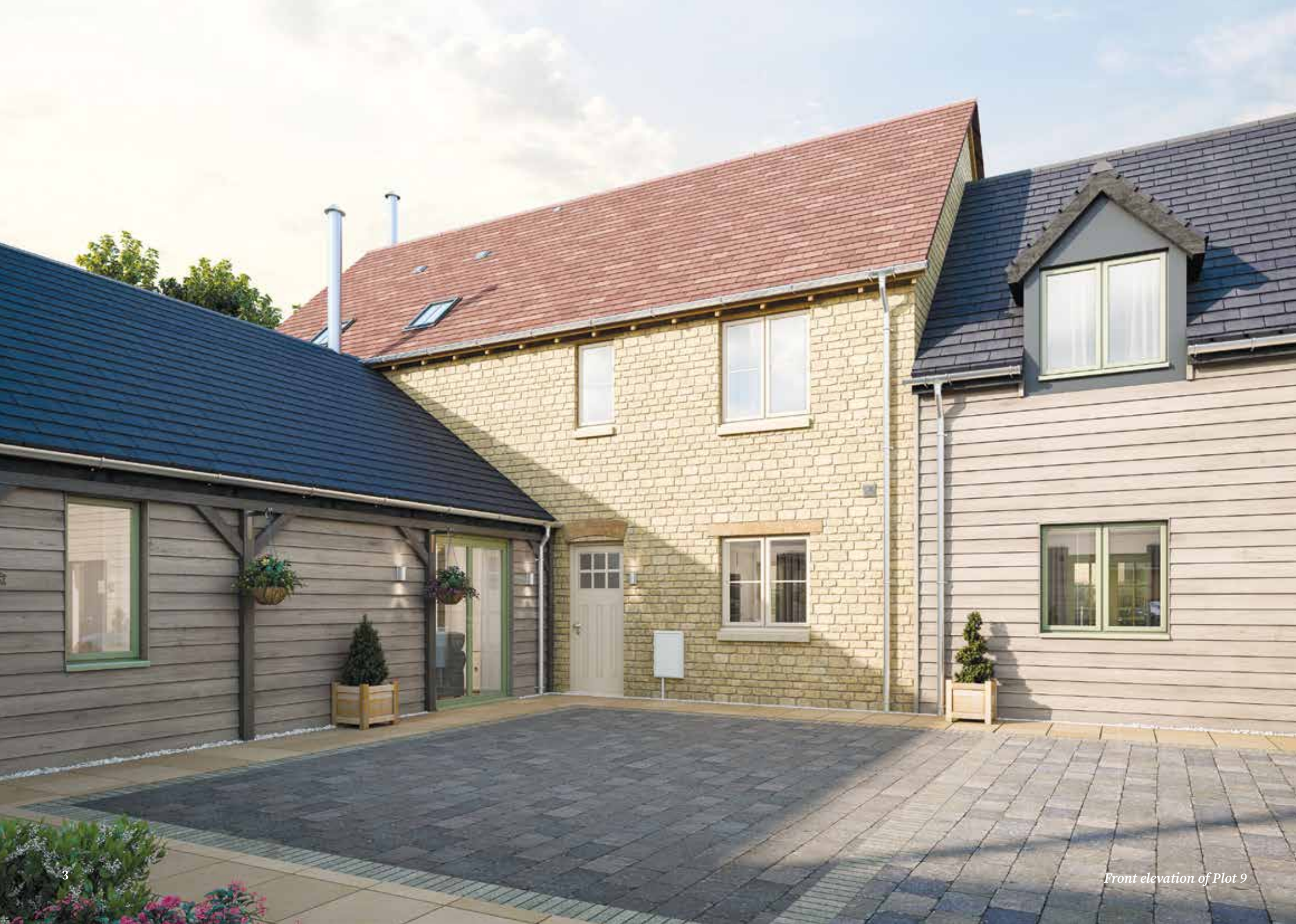
Front elevation of Plot 9