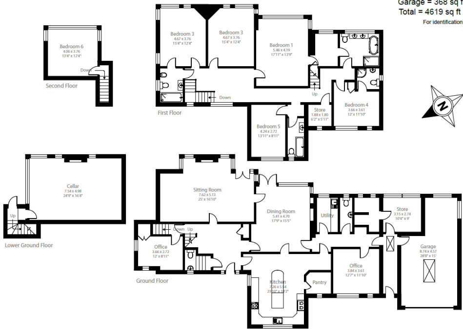
Floor plan produced in accordance with RICS Property Measurement Standards incorporating International Property Measurement Standards (IPMS2 Residential). © richcom 2023. Produced for Carter Jonas. REF: 1000533

Approximate Area = 4251 sq ft / 394.9 sq m Garage = 368 sq ft / 34.2 sq m Total = 4619 sq ft / 429.1 sq m For identification only - Not to scale