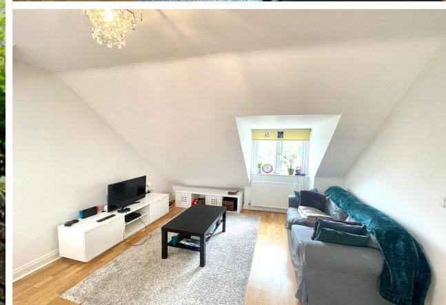
AMARNA HOUSE, DOUGLAS DOWNES CLOSE, OX3 £1,400 per month*