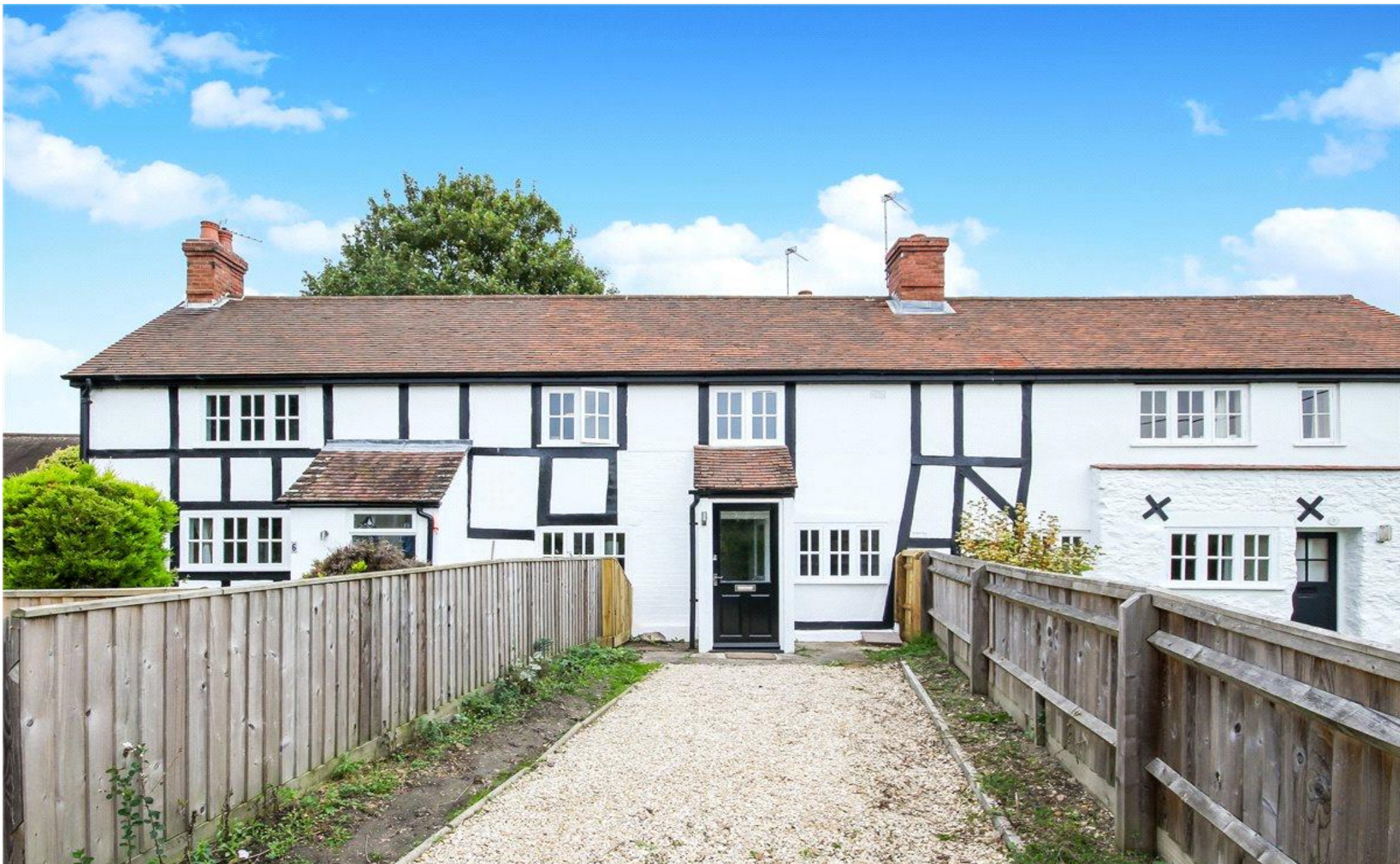
CHURCH COTTAGES, CHURCH LANE, OX44 £1,050 per month*