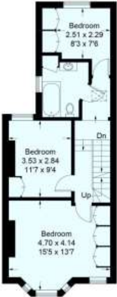
First Floor 51.5 sq m / 554 sq ft