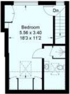
Second Floor 29.2 sq m / 314 sq ft (Including Reduced Headroom)