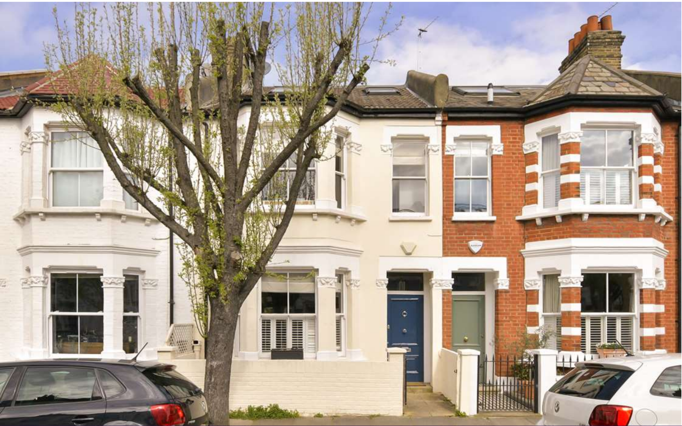
EDGARLEY TERRACE, LONDON, SW6 £1,350,000