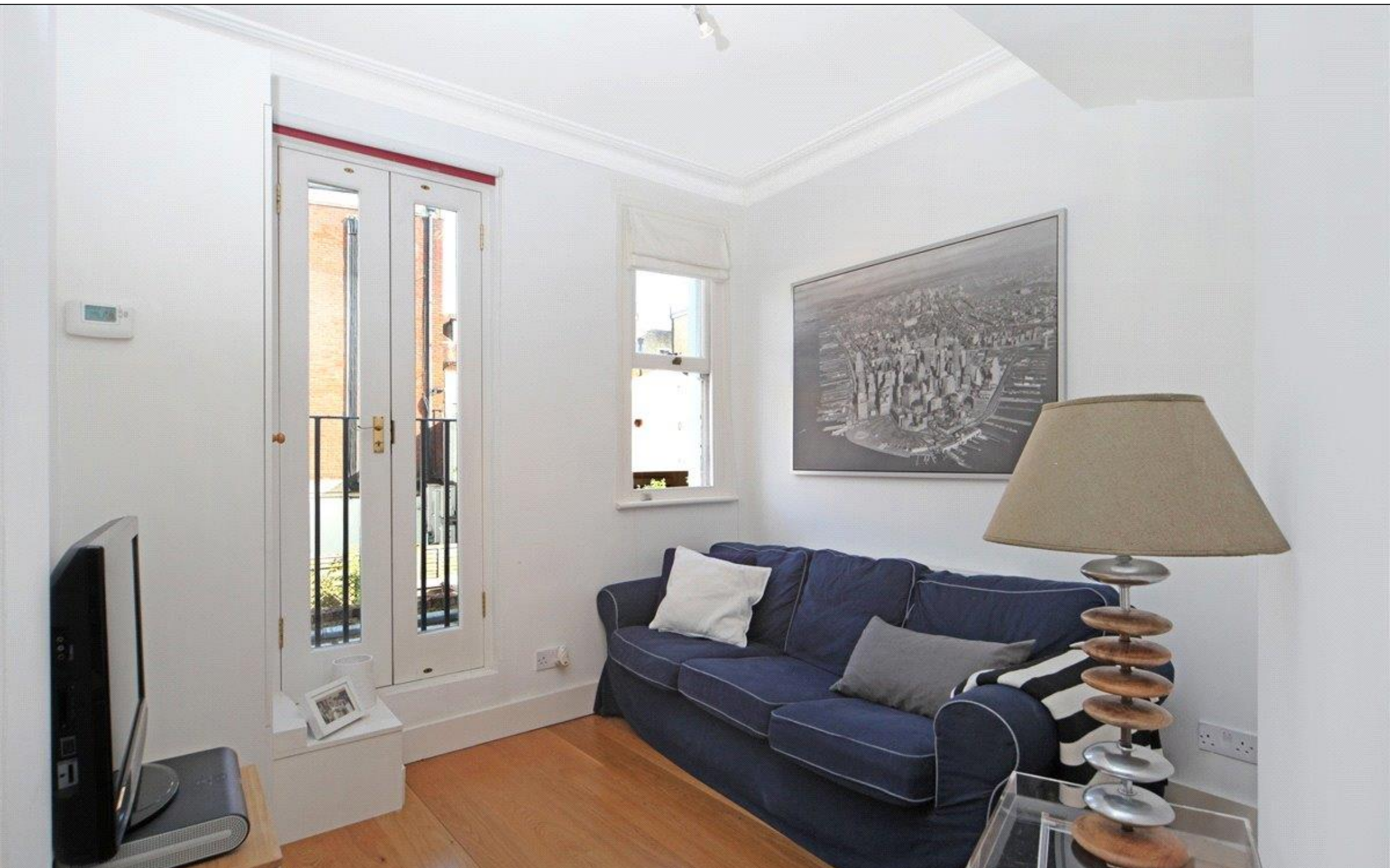
FULHAM PARK GARDENS, LONDON, SW6 £450,000