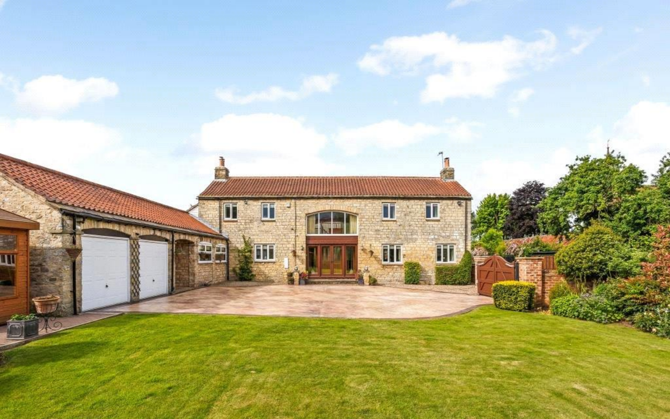
THE BARN, OLD PEAR TREE FARM, RUFFORTH £925,000