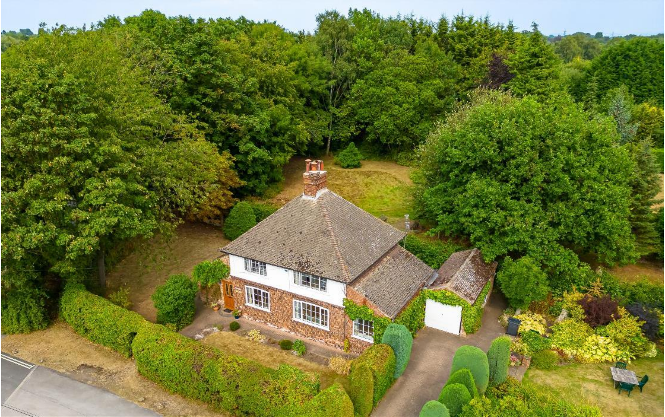
KANONI, 138 HESLINGTON LANE, YORK £795,000