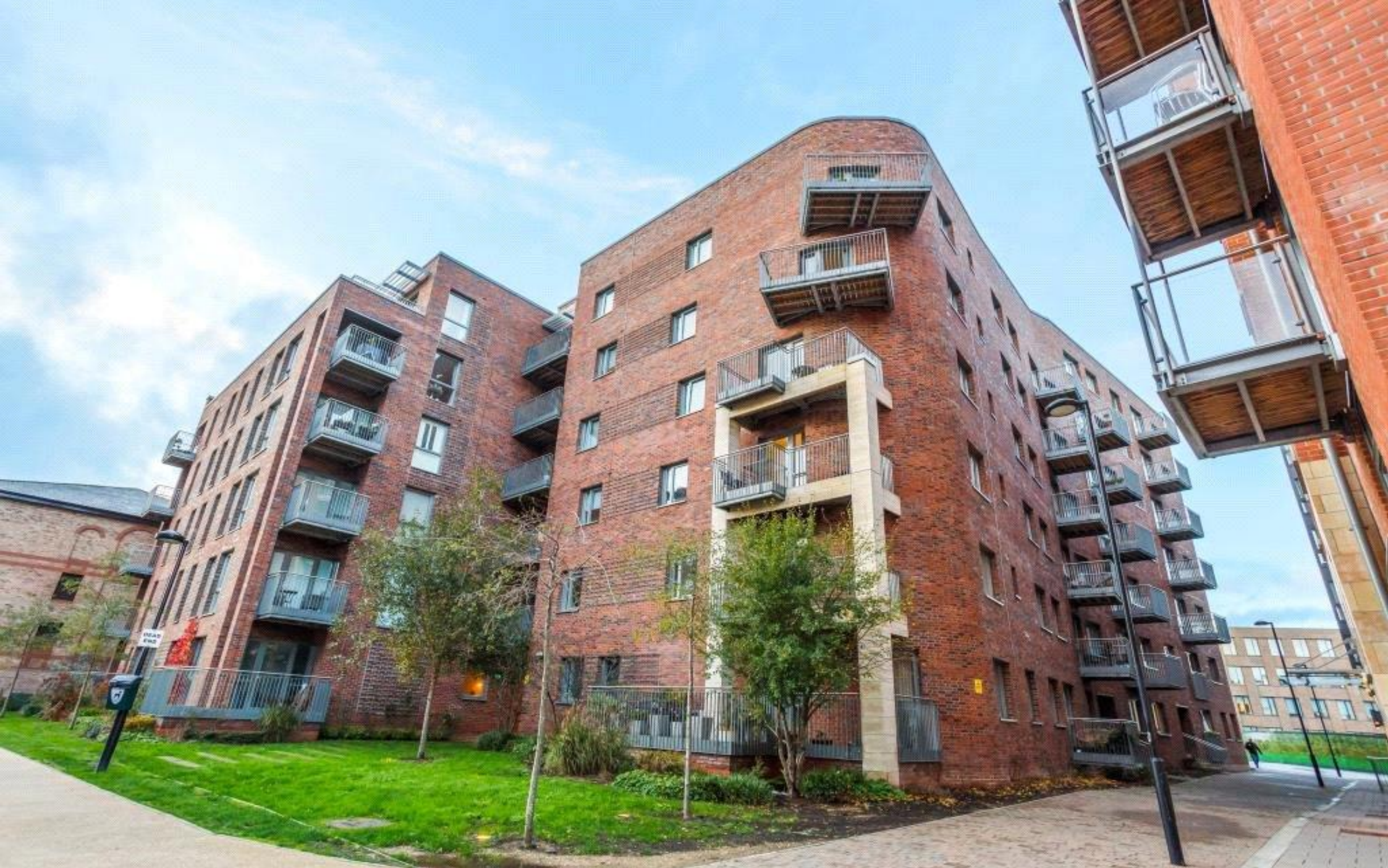
54 BELLERBY COURT, YORK Guide Price £475,000