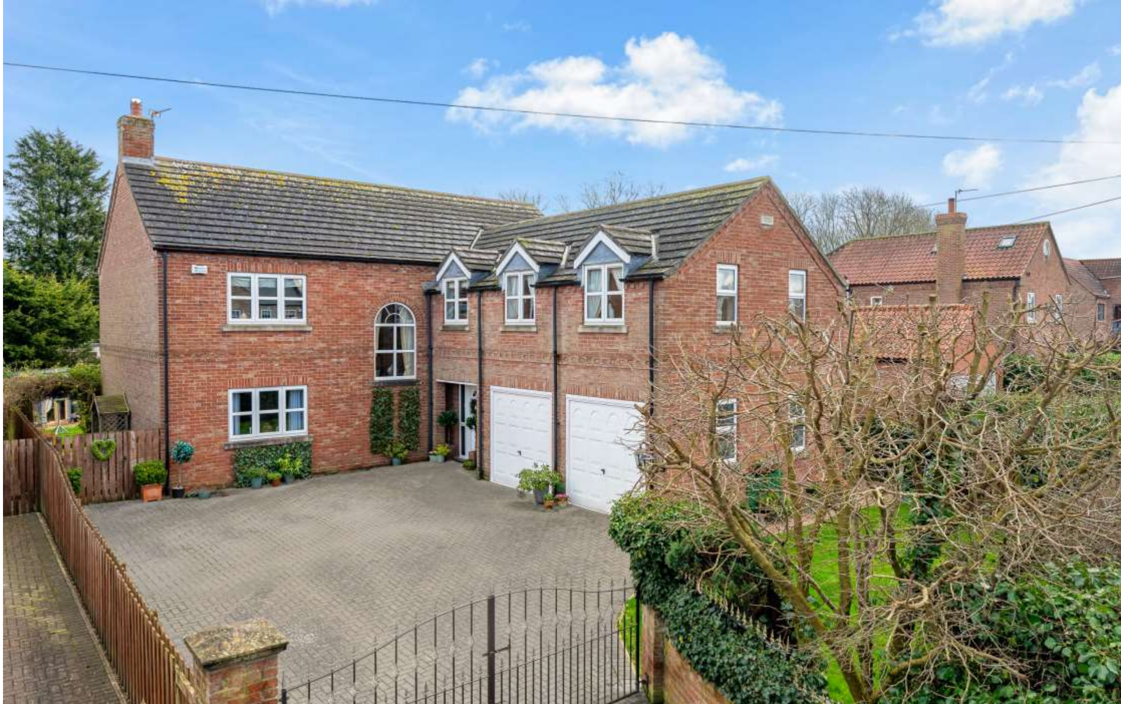
WINDFALL LODGE, BRIGHTON, YO8 6DH OIEO £630,000