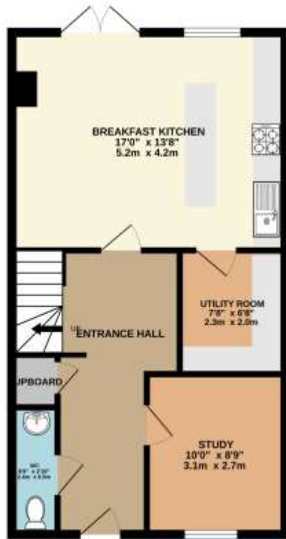
GROUND FLOOR 536 sq.ft. (49.8 sq.m.) approx.