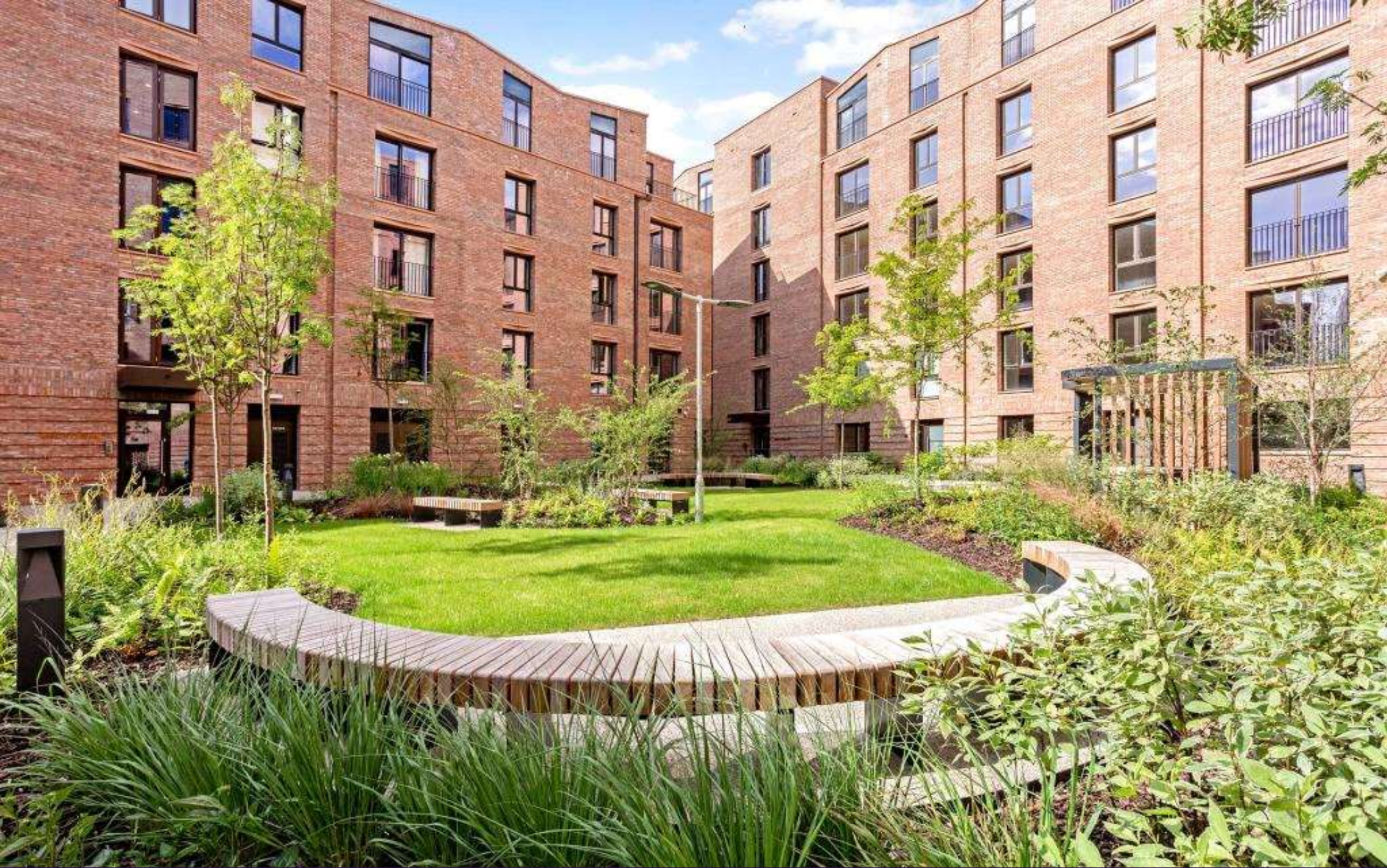
HUDSON QUARTER, TOFT GREEN, YORK £250,000