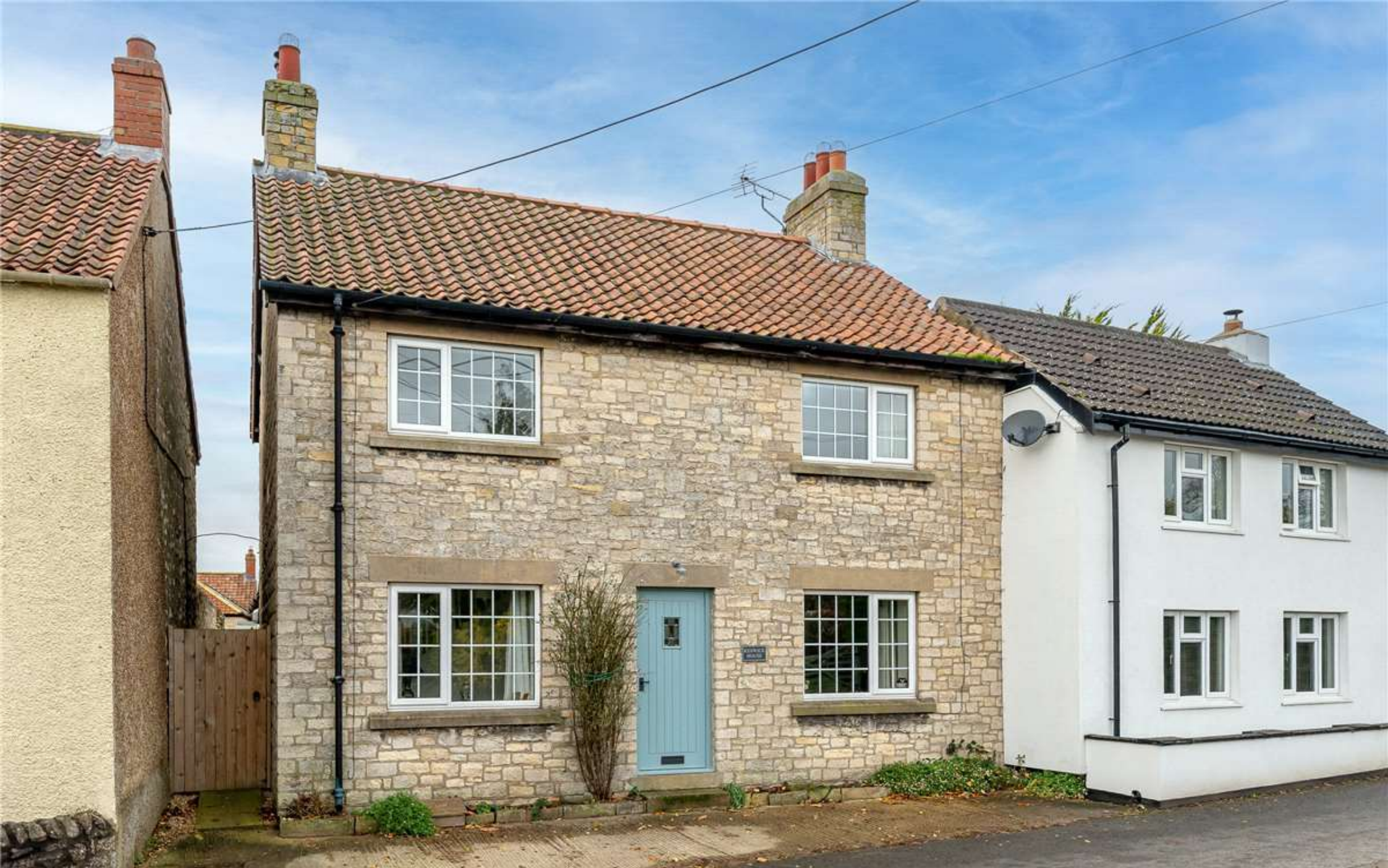
KESWICK HOUSE, PAGE LANE, WOMBLETON £469,950