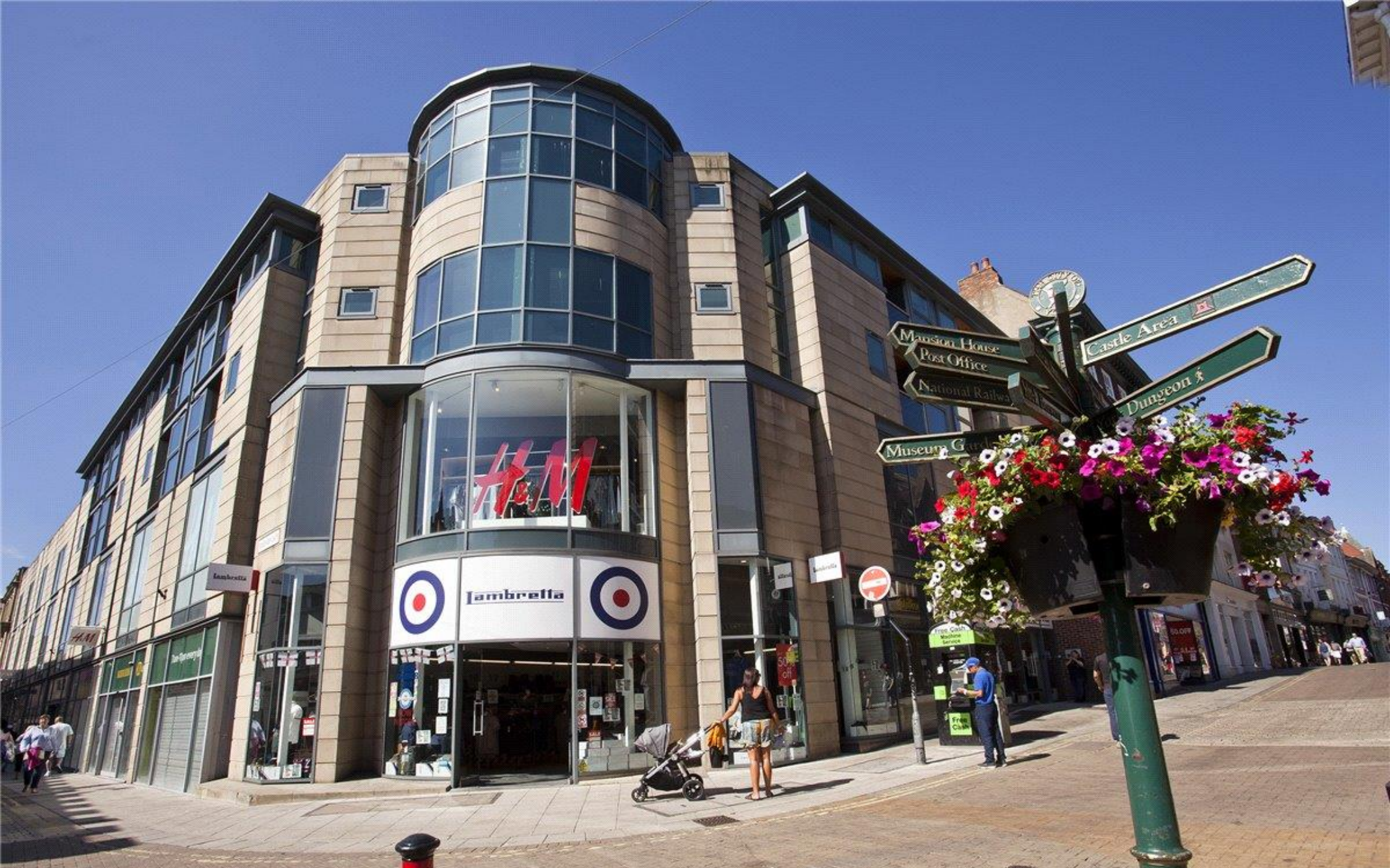
7 SPURRIERGATE HOUSE, PETER LANE, YORK £249,950