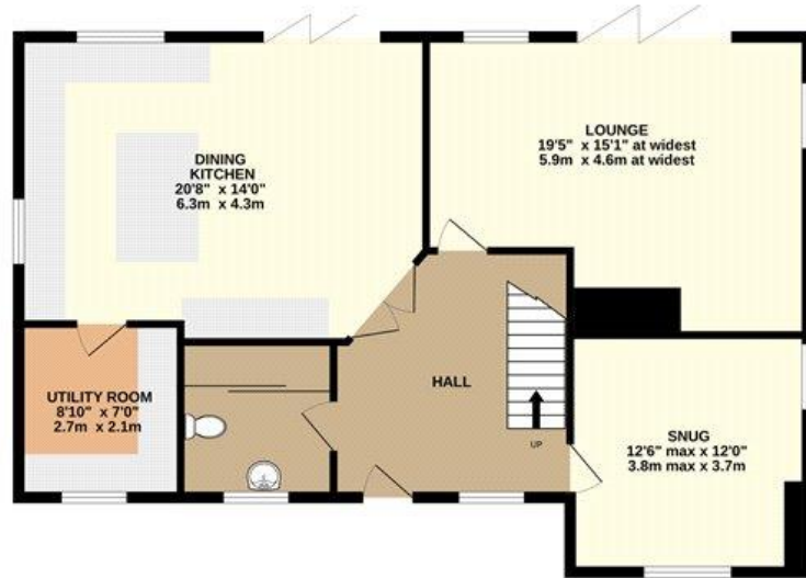
GROUND FLOOR 963 sq.ft. (89.5 sq.m.) approx.