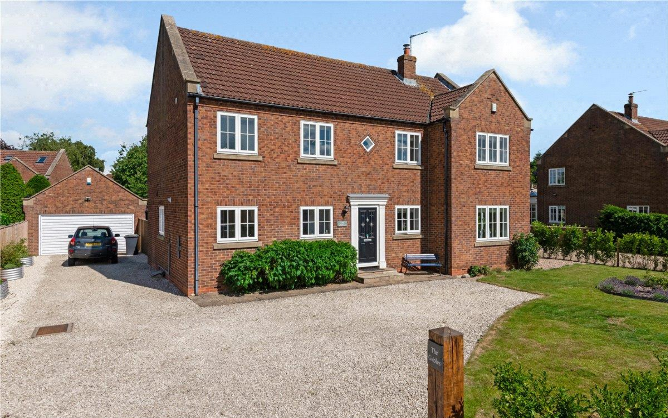
THE GABLES, MILL LANE, ACASTER MALBIS £925,000