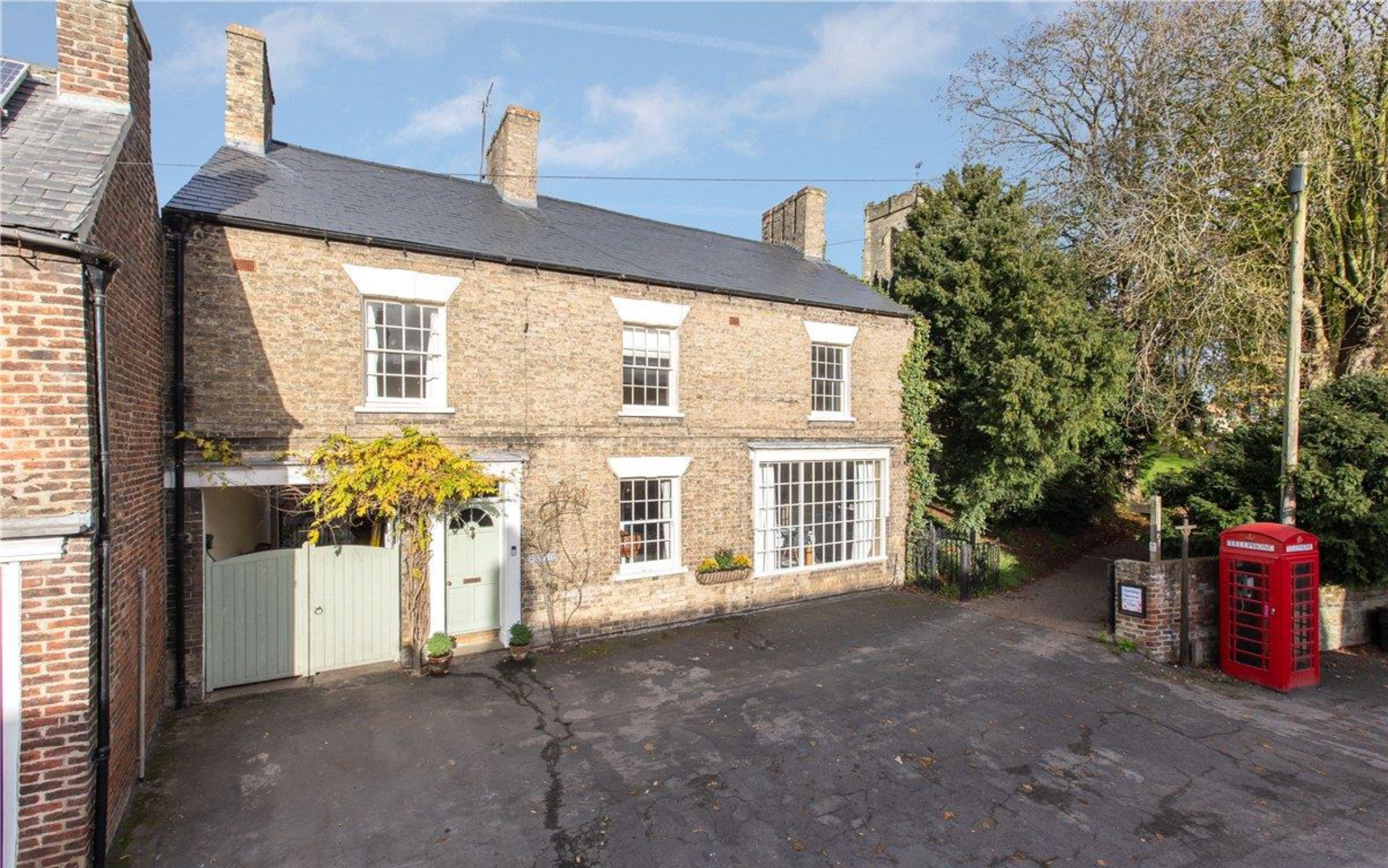
WOLD HOUSE, CHURCH STREET, KILHAM Offers over £495,000