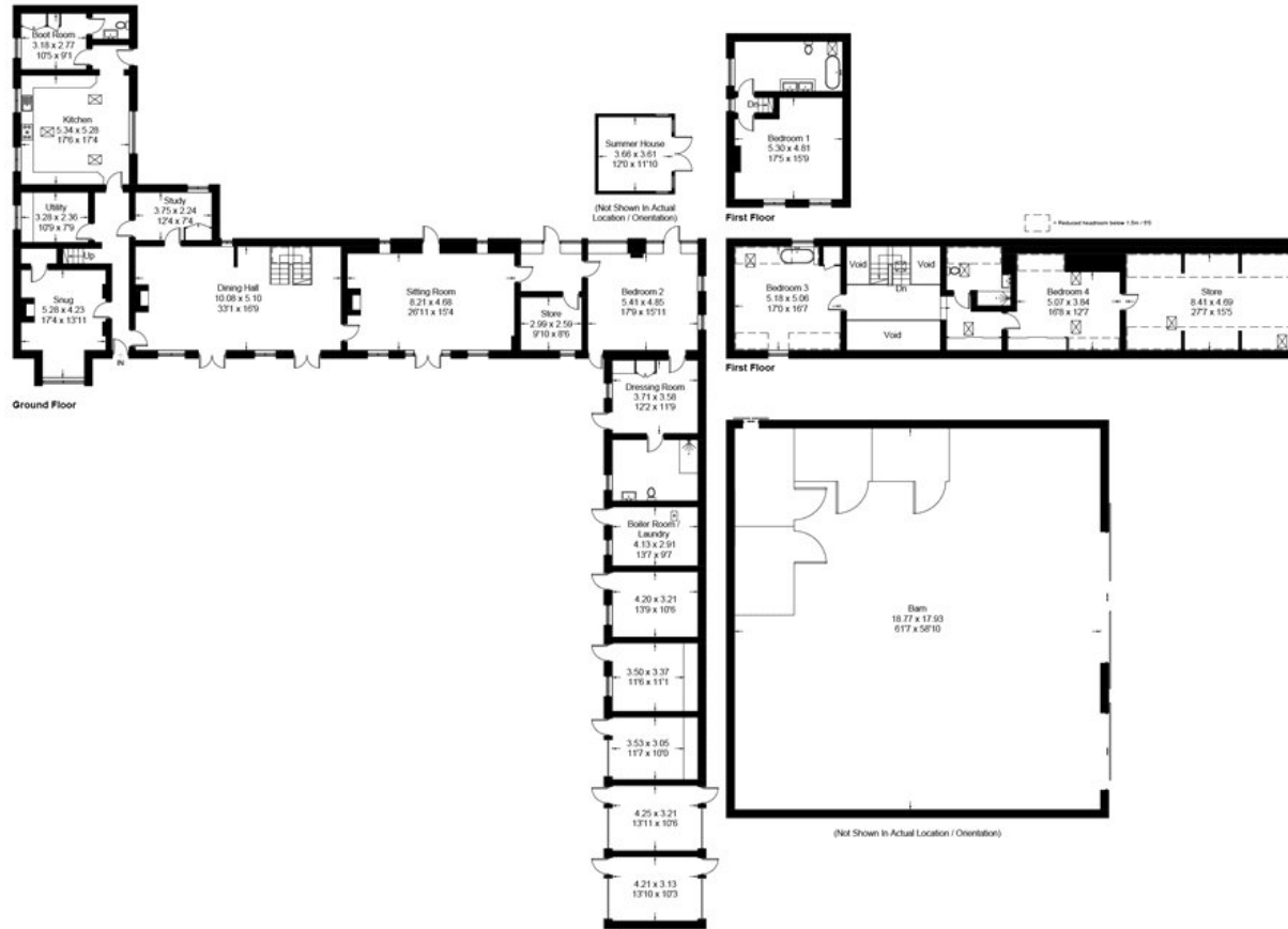
illustration for identification purposes only. measurements are approximate, not to scale Pursuant to RICS Property Measurement 2nd Edition © Intelligent Property Marketing 2026

Address: Westfield Farm, Yedingham, MALTON, YO17 8SS RRN: 0290 2865 8640 2626 6115